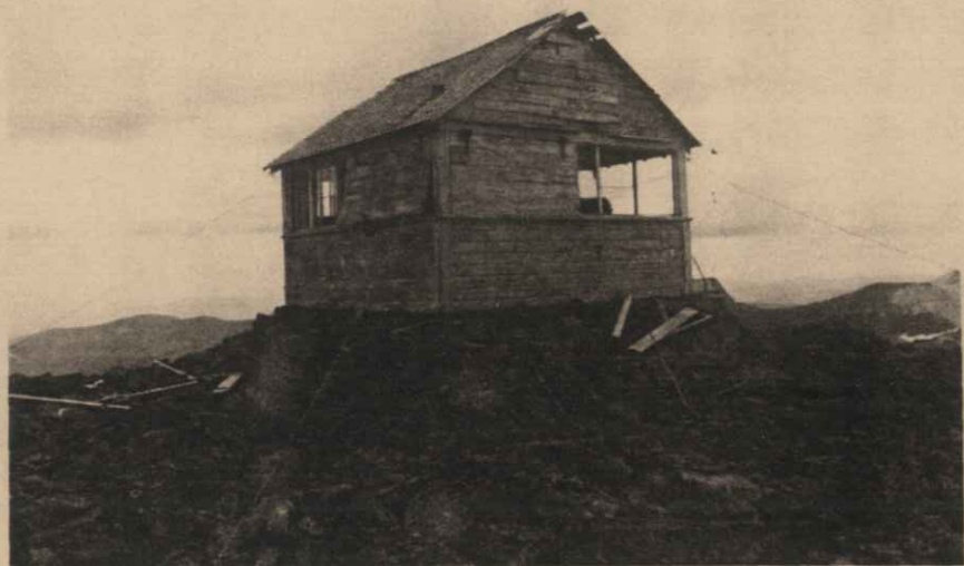
Northwest Peak Lookout, Montana view to the Southwest

I visited many fire lookouts this past summer as part of an historical survey for Region 1 of the U.S. Forest Service. Fire lookouts represent a generation of security for our forest resources, but their future is uncertain. Adaptive reuse is one possibility. A few have been resurrected in Montana as part of the "Cabin Rental Program", through which an individual or group can rent the lookout for a day or week and experience life on a mountaintop. Sadly though, many lookouts fall victim to the conflict between cultural and natural resources. For example, if a lookout is located within grizzly bear habitat, the bears win. Grizzlies, an endangered spe-