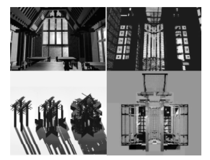
Figure 2. Univ. of California at Berkeley Faculty Club model by Samuel Adams (upper left) was used by Daniel Leckman in collages & animations.

desktop video-conferencing used for the remote partnerships. These studio-based activities have been complemented by controlled laboratory-based experiments in which subjects have used whiteboards, text chat or voice, sometimes supplemented by video communication. The range of projects used in these various settings has explored a variety of design opportunities and collaborative strategies.