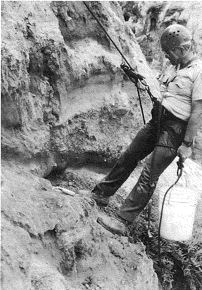
Figure 3. Closeup of 9300 year old shell midden stratum at CA-SRI-6.

ta Barbara Channel waters through fissures in the ocean floor and washes ashore on northern Channel Island beaches. In historical times, asphaltum was used by Chumash Indians as a glue or mastic.