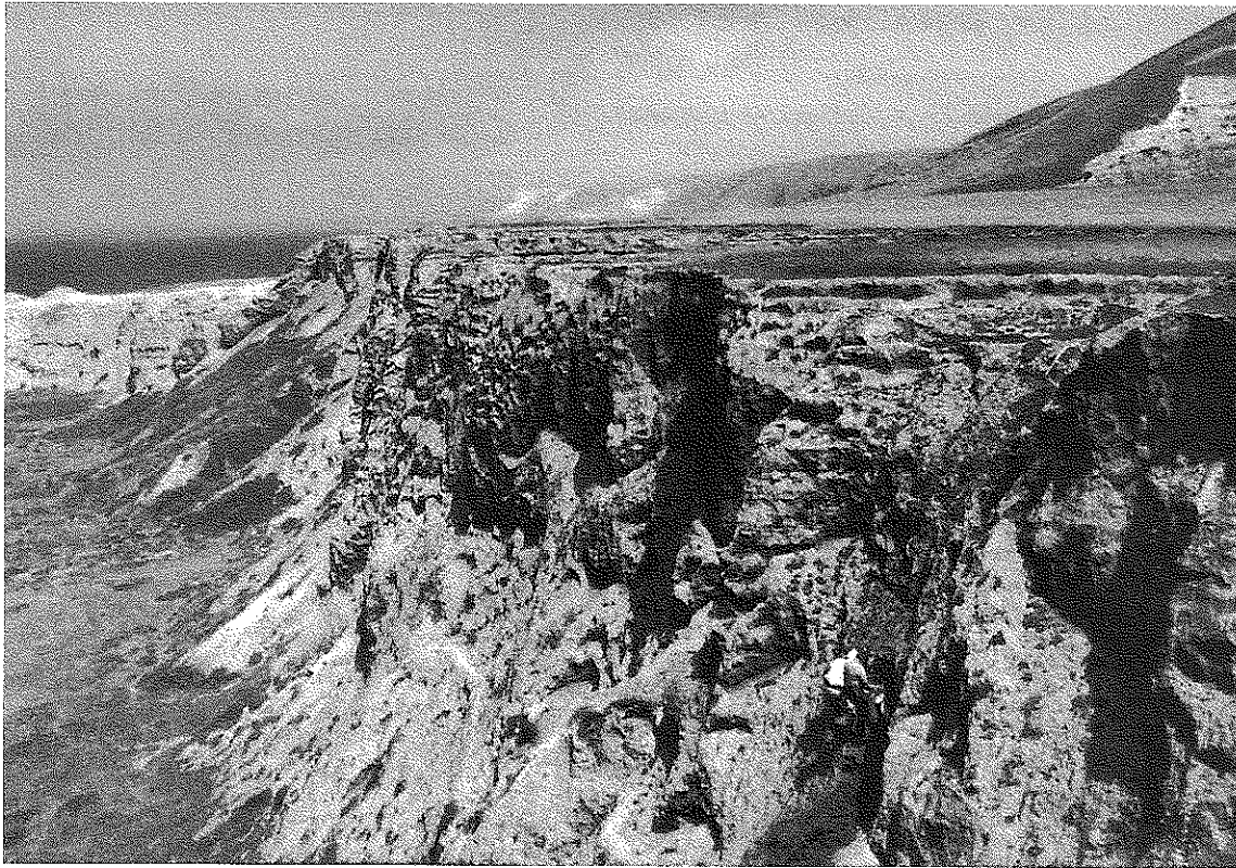
Figure 2. Overview of seacliff exposures at CA-SRI-6 (looking east), with figures suspended at 9300 year old shell midden.

ly in vertical sea cliff exposures and deeply buried, conventional excavation procedures were impractical. Instead, we collected sediment samples from the eroding cliff face. A 121 liter (0.121 cu m) sample of midden soil was excavated from the central (and densest) part of the site, sealed in 5-gallon buckets and lowered to a screening crew at the bottom of the cliff. The excavated sediments were dry-screened over \frac{1}{8} -inch mesh to reduce their bulk and later water-screened to remove the remaining earth. Along with the larger midden sample, we also collected a 3 liter sample of midden soil for fine-screen ( \frac{1}{16} -inch) processing for smaller constituents, including macrobotanical remains.