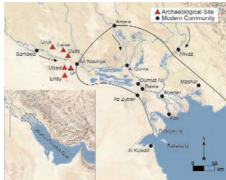
Mesopotamia, then and now (the coastline as it was 6000 years ago is outlined in black).

Kennett and Kennett compare local climatic and geographical changes with concurrent societal developments in specific regions of the Persian Gulf between 15,000 and 6000 years ago. They suggest that early development was shaped by the formation of productive estuaries,