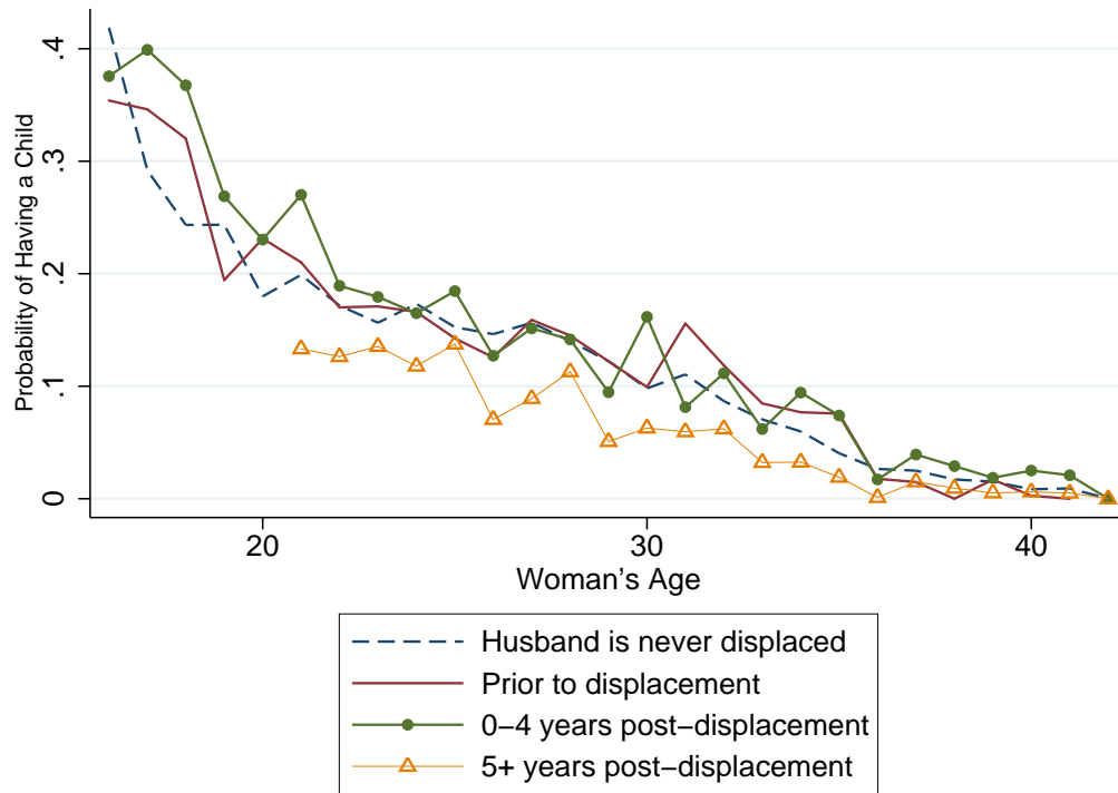
Figure 2 Age-probability of Conception Profile by Husbands' Displacement Status