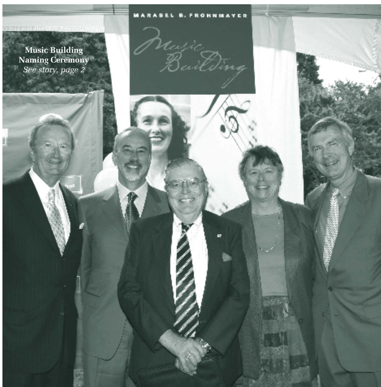
Music Building Naming Ceremony See story, page 2