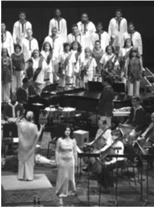
The Scola Cantorum from Venezuela performs La Pasión Según San Marcos.

The 2006 Festival takes place June 30–July 16 in Eugene, with Rilling to return for his 37 th season in a celebration of Mozart's 250 th birthday. ♦