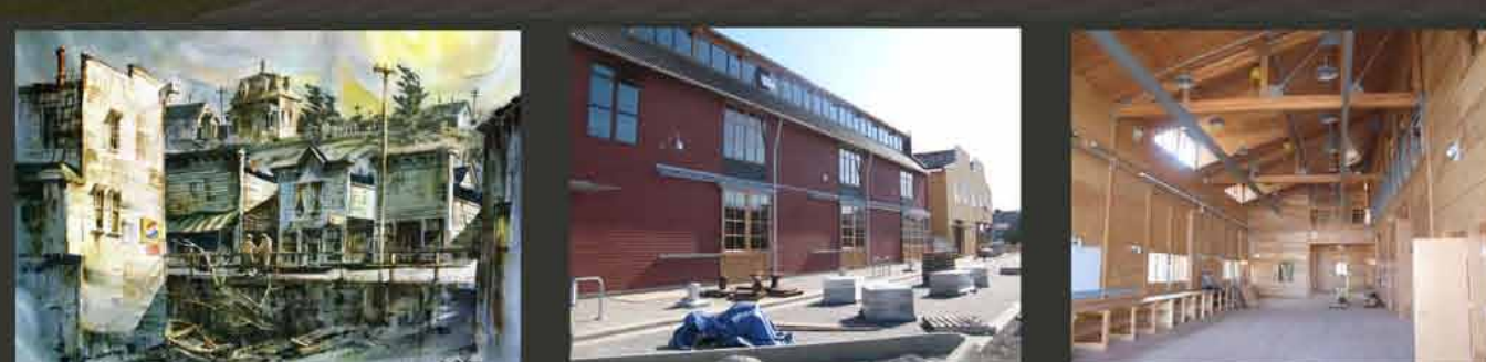
"WHARF" BUILDING CAFE