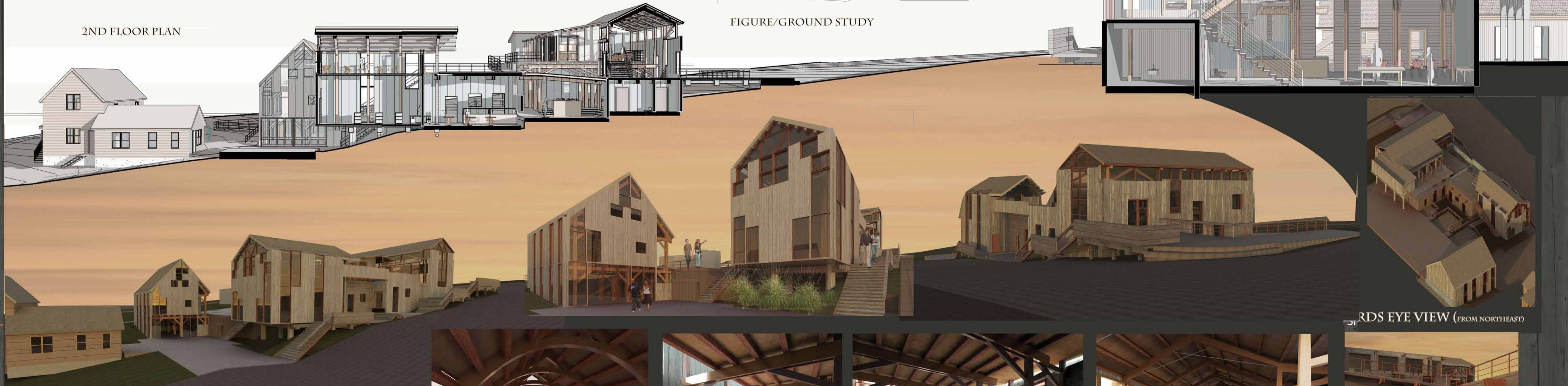
RDS EYE VIEW (FROM NORTHEAST)