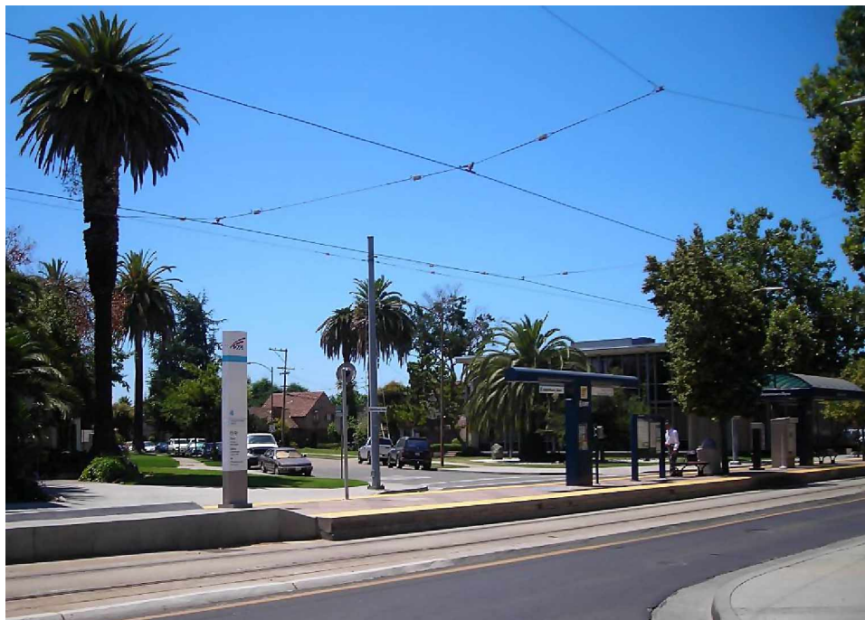
Figure 1. Looking east to Japantown station.

El Cerrito Plaza station. The El Cerrito Plaza station is part of the Bay Area Rapid Transit system (BART), which serves four counties in the San Francisco Bay Area, California, region. The neighbourhood around the station is laid out in a grid street network. The area is primarily residential, with several commercial streets, plus a large shopping centre south of the BART station. Underneath the BART tracks runs a popular bicycle and pedestrian path. The catchment area for potential walkers to the BART station is quite large. There are no major barriers created by freeways or other features of the built environment, except that walkers do face some hills in neighbourhoods rising up a moderately steep hill a few blocks to the east.