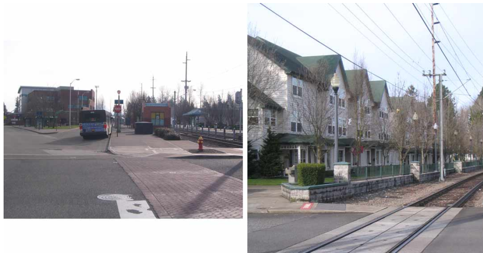
Figure 4. Looking at both sides of the Gresham station.