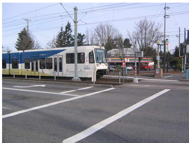
Figure 5. The west-bound train at the Rockwood station.

eligibility for the study: (1) if they were over 18 years of age, and (2) if they would be willing to participate in the study. Willing survey respondents received a written survey.