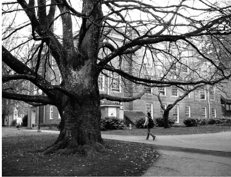
Large beech tree next to Gerlinger Hall, 2005.