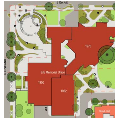
EMU site plan.

13 - The Erb Memorial Union , built in 1950 and expanded in the 1970s, represents a range of building styles from this era. The EMU was designed as a catalyst for students to approach the administration about important student issues, as well as a place where students could study or relax. The amphitheater was remodeled in 1998 and further supports the EMU's purpose. The original portion of the EMU, facing University Street, is a brick building in the Modernist style. A major addition in the 1970s was built on the northeast side of the EMU in the Brutalist style of concrete.