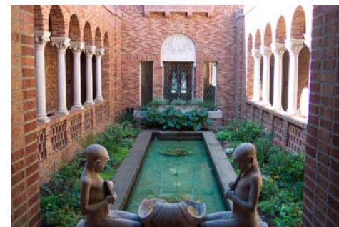
View from within the PLC courtyard in the Jordan Schnitzer Museum of Art.