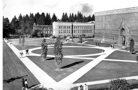
View of the Memorial Quad with the Schnitzer Museum of Art on the right.

8 - As early as 1914 the Memorial Quadrangle was part of Ellis Lawrence's campus plan to be a more formally designed campus open space. It continues to function as an active and well-liked space within the academic core. The distinctive 'X' and 'O' paths of the quad, along with the Knight Library's terrace and fountain, were designed by Frederick Cuthbert in 1932.