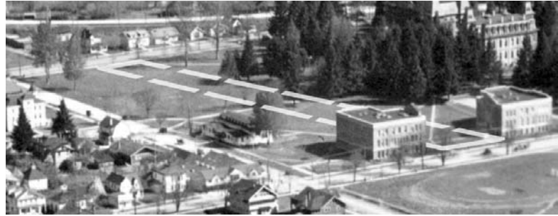
A 1921 image showing Peterson and Gilbert Halls, with the area later to become the Axis extending northward between them.