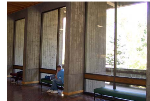
McKenzie interior showing roughcast concrete.