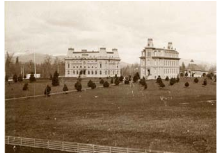
An early image of the Axis showing the newly-planted Douglas fir trees.

5 - The Deady Hall Walk Axis begins at what was the first formal entrance onto campus at Kincaid Street, connecting the Eugene community to the first university building, Deady Hall. Around 1896 the allée of Douglas fir trees was planted on either side of the concrete walk. Underfoot you will notice historic concrete sections with inscriptions from past annual University Days—a continuing tradition for students, faculty, and staff to join together and spruce up the campus.