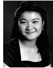
Symphony Chorus, and the Oregon Bach Festival.