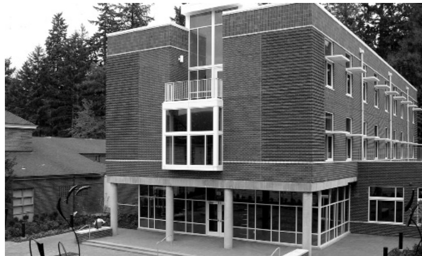
The DeArmond Academic Wing, one of two new wings opened in

A beautiful campus environment, nearly thirty music ensembles, and a superb faculty to prepare you for a successful career in teaching, performing, conducting, or composing. And with two new wings added to the music building, there are more reasons than ever to come to Oregon!