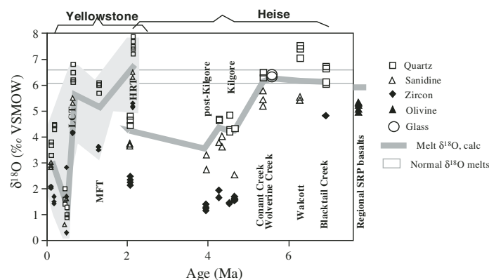
Figure 2. Oxygen isotope phenocryst values vs. 40 Ar/ 39 Ar eruptive age for volcanic rocks of Heise volcanic field (this work; see footnote 1), as compared to Yellowstone (data from Bindeman and Valley, 2001). Major episodes of caldera formation are labeled by the name of the caldera-forming ignimbrite (see Table 1). Note progressive depletion of \delta^{18}\text{O} values in each caldera cluster, interpreted here to represent remelting of hydrothermally altered rocks progressively buried by caldera collapses. Zircons in low \delta^{18}\text{O} Kilgore ignimbrite and post-caldera lavas are in isotopic equilibrium with quartz and feldspar and do not show \delta^{18}\text{O} variation as a function of size (Table 1). Abbreviations: HRT—Huckleberry Ridge tuff; MFT—Mesa Falls tuff; LCT—Lava Creek tuff. VSMOW—Vienna standard mean ocean water.

U-Pb zircon ages were determined in nine samples: two samples of Kilgore ignimbrite, four samples of post-Kilgore rhyolites, and one sample each of Blacktail Creek, Conant Creek, and Wolverine Creek tuffs (Table 1). The U-Pb ages in most samples are normally distributed and therefore are treated as single populations. Disequilibrium-corrected 206 Pb/ 238 U zircon crystallization ages overlap within uncertainty with 40 Ar/ 39 Ar sanidine eruption ages. Post-Kilgore rhyolite of Long Hollow erupted at the inferred ring fracture, and rhyolites of Juniper Buttes in the