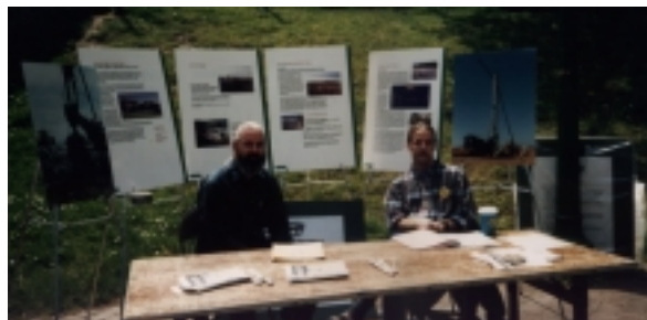
The guys from EPUD show off their renewables