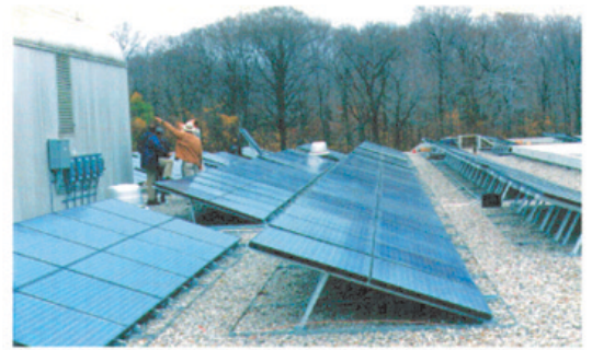
Internet image shows roof rack mounting