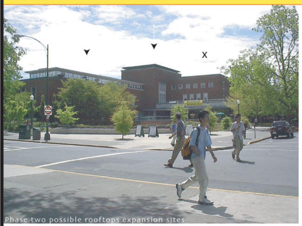
Phase two possible rooftops expansion sites