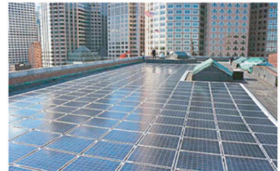
Internet image shows Powerlight roof modules