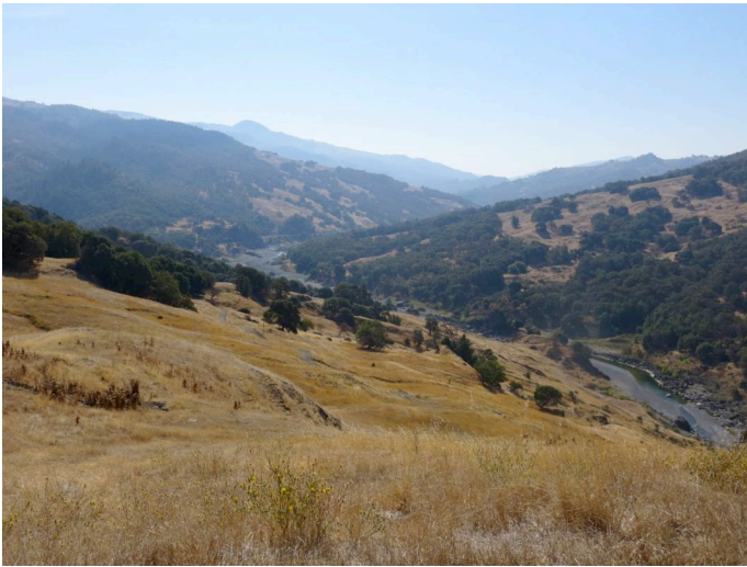
Eel River Mainstem