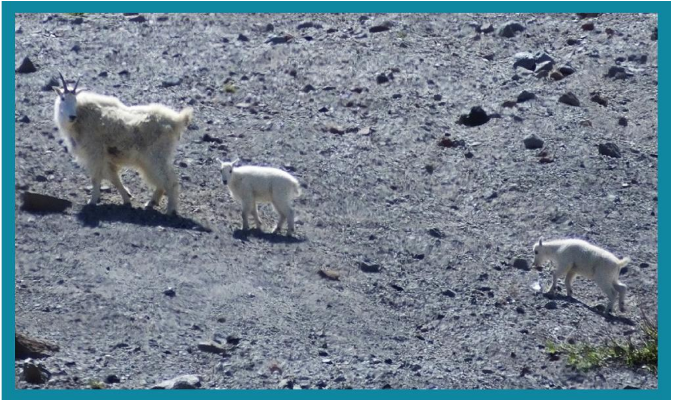
Nanny and kids.

Volume Fifty-three, Number One, January 2018