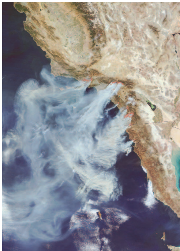
Figure 3. Satellite image of fires that spread across southern California, 26 October 2003. This image was captured by the Moderate Resolution Imaging Spectroradiometer (MODIS) on the Terra satellite. The fires, which are marked in bright red, send streamers of gray-blue smoke into the air. The Terra and Aqua satellites view the entire Earth's surface every 1 to 2 days, acquiring data in 36 spectral bands. Imagery and data from MODIS can be rapidly provided to a number of users, including the USDA Forest Service, to facilitate wildfire management. In general, these types of informatics tools will improve understanding of global dynamics and processes occurring on the land, in the oceans, and in the lower atmosphere.

Advances in data generation and computing technologies have increased scientists' understanding of issues including lake metabolism, the movement of elusive species, landscape-scale patterns and processes, and the impact of natural disasters such as hurricanes (Estrin et al. 2003). Building on