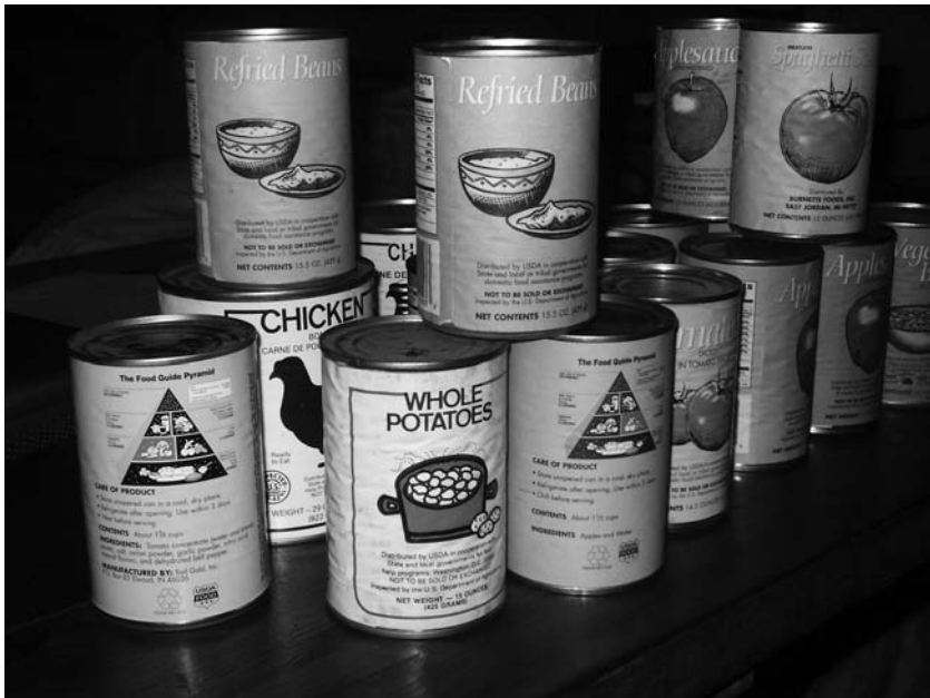
Figure 2.3 Commodity canned foods

Forced assimilation is ongoing today, although its vehicles may be less overt than in boarding schools. Instead as we discussed in the previous section, forced assimilation occurs because a significant proportion of Karuk cultural food management and production practices are illegal. Forced assimilation also happens when Karuk food sources are so depleted that tribal people must eat government commodity foods instead (see figure 2.3). While there is no policy designed to change how Karuk people view and use the land parallel to the ways that boarding schools explicitly enforced “white” behaviors onto Indian people, forced