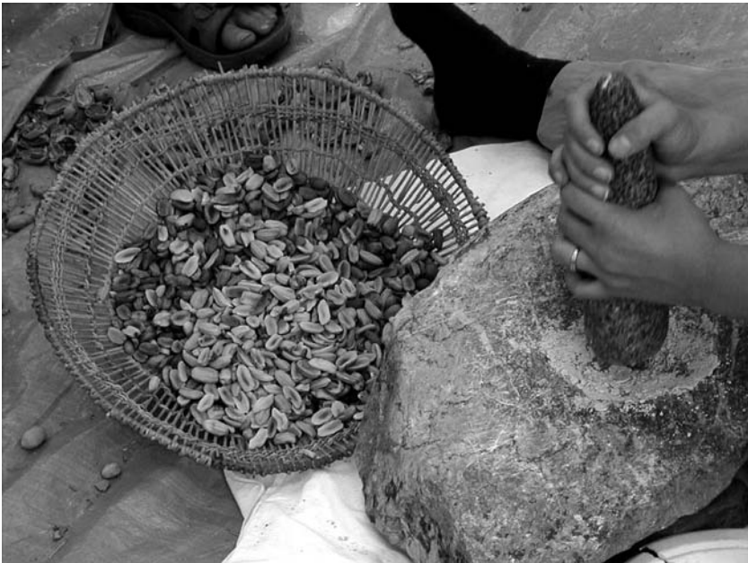
Figure 2.1 Grinding acorns

Spring Chinook have been the single most important food source to decline, but there are at least twenty-five species of plants, animals, and fungi that form part of the traditional Karuk diet to which Karuk people are currently denied or have only limited access. Without salmon and tan oak acorns, Karuk people are currently denied access to foods that represented upward of 50 percent of their traditional diet (see figure 2.1). With the destruction of the once abundant riverine food sources, a significant percentage of tribal members rely on commodity or store-bought foods in lieu of salmon and other traditional foods. Food insecurity within the Karuk Tribe is evidenced by the fact that a survey conducted by the tribe in 2005 found that 42 percent of respondents living in the Klamath River area received some kind of food assistance. 1 One in five