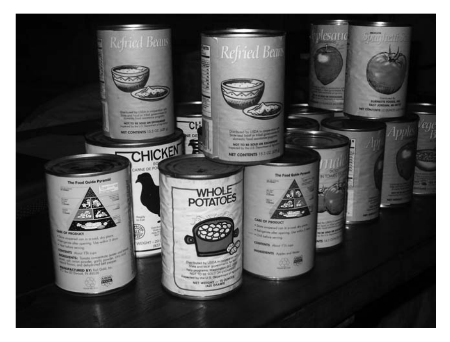
Figure 2.3 Commodity canned foods

Forced assimilation is ongoing today, although its vehicles may be less overt than in boarding schools. Instead as we discussed in the previous section, forced assimilation occurs because a significant proportion of Karuk cultural food management and production practices are illegal. Forced assimilation also happens when Karuk food sources are so depleted that tribal people must eat government commodity foods instead (see figure 2.3). While there is no policy designed to change how Karuk people view and use the land parallel to the ways that boarding schools explicitly enforced "white" behaviors onto Indian people, forced