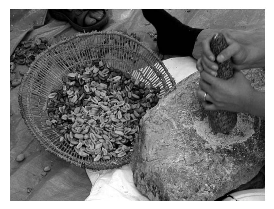
Figure 2.1 Grinding acorns

Spring Chinook have been the single most important food source to decline, but there are at least twenty-five species of plants, animals, and fungi that form part of the traditional Karuk diet to which Karuk people are currently denied or have only limited access. Without salmon and tan oak acorns, Karuk people are currently denied access to foods that represented upward of 50 percent of their traditional diet (see figure 2.1). With the destruction of the once abundant riverine food sources, a significant percentage of tribal members rely on commodity or store-bought foods in lieu of salmon and other traditional foods. Food insecurity within the Karuk Tribe is evidenced by the fact that a survey conducted by the tribe in 2005 found that 42 percent of respondents living in the Klamath River area received some kind of food assistance.<sup>1</sup> One in five