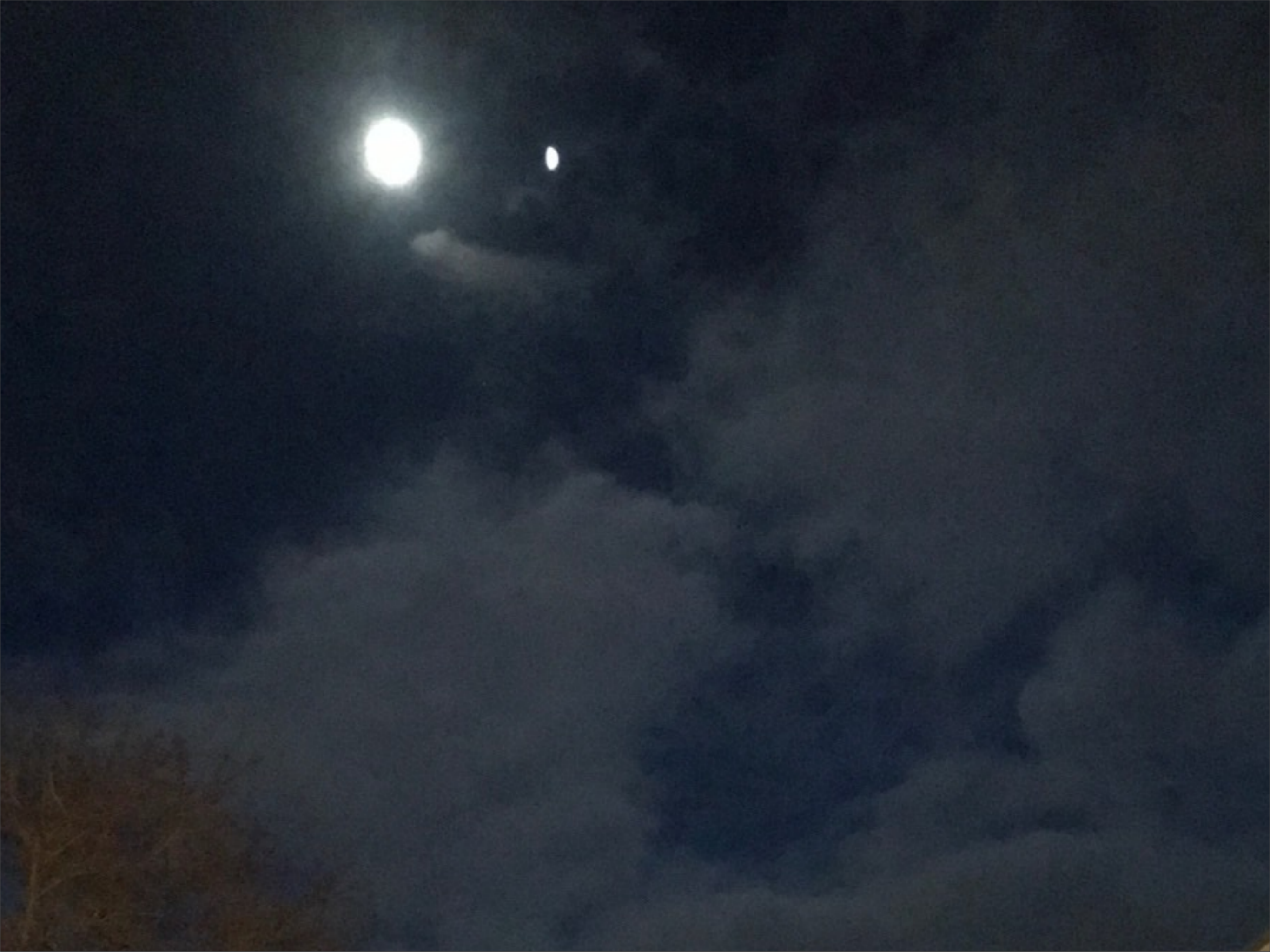
Friday, January 18, 19